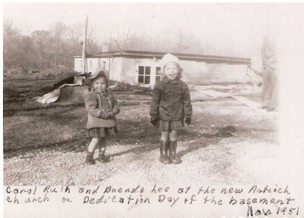
At the dedication of the basement building

Excavation started right away with a 'slip-scoop', a device pulled behind a tractor while at the same time pushed by a worker to move about a wheelbarrow full of dirt. Although partially mechanized, it was still hard work. Most of the labor was supplied by the members as it is still today. On October 28, 1951 the work had progressed sufficiently to hold the first service in the basement.