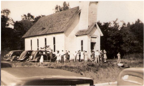
Antioch's first building before and after