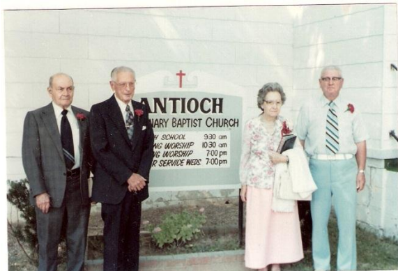
Antioch's charter members